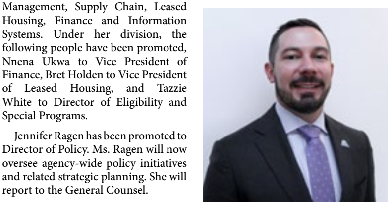
In the Office of Audit and