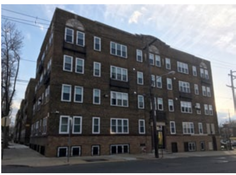
The Lindley Apartments opened in late January, thanks to a PHA subsidy through project based vouchers. The senior development is located at 1300 Lindley Avenue in the Logar

The company opened this development through a subsidiary, Pinnacle Enterprises, LLC, a firm dedicated to providing affordable housing to seniors and at risk populations. WES recognizes that