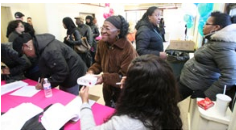
uring the kickoff event for the partnership between PHA and T-Mobile. The kick- off event vas held at West Park Apartments because it is a part of the Promise Zone, which is a federal gram that aims to reduce poverty and bring greater opportunity to people living and

Prior to the partnership with T-Mobile, PHA and its partners installed WiFi broadband Internet access at four developments, offered Internet service at low or no cost to residents, and provided laptops and computer training to residents The housing authority also operates 15 computer labs at its housing developments.