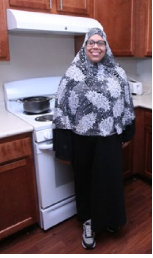
Residents of the former Blumberg Apartments complex in the Sharswood neighborhood began moving in to Blumberg Phase I's new homes in mid-February.