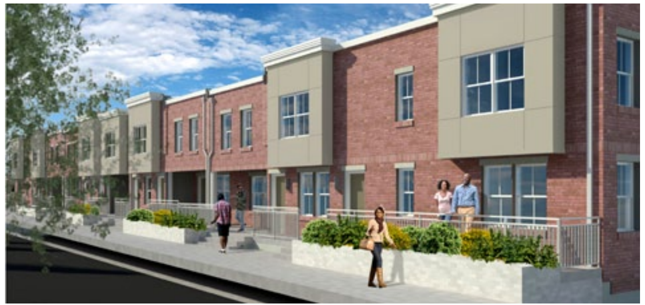
Strawberry Mansion Apartments will consist of one, two, three and four-bedroom homes in a mix of walk-up apartments and townhomes. The 55-unit development covers an area bounded by 33rd Street to the West. Arlington Street to the North. 32nd Street to the East, and Berks Street to the South.

U.S. POSTAGE PAID PERMIT NO. 6868 PHILA, PA