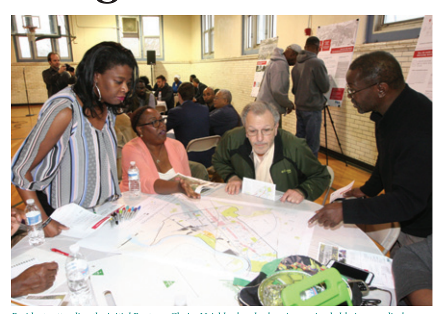
Residents attending the initial Bartram Choice Neighborhoods planning session held vigorous, lively discussions on action activities to transform Bartram Village and Kingessing as they poured over maps and story boards.

(See "Many Questions About Bartram Neighborhood Development", Page 7.)