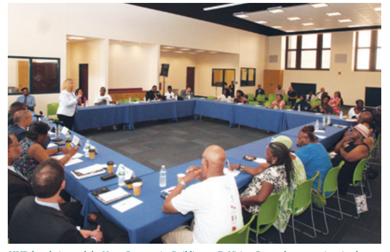
HUD has designated the Vaux Community Building an EnVision Center demonstration site that offer HUD-assisted families access to support services that can help them become self-sufficient, as well as helping households currently waiting for assistance. PHA and HUD officials held a resident roundtable on July 16th to hear what types of services residents would like to have at the center, and later met with agency partners in the Sharswood Transformation Plan.

PHA already has a partnership with Temple University's College of Public Health and its Department of Nursing to operate nurse managed clinic at the Vaux Building. Additional space is currently undergoing rehabilitation to enable employment, training, financial literacy and other partners to offer programming to the community.