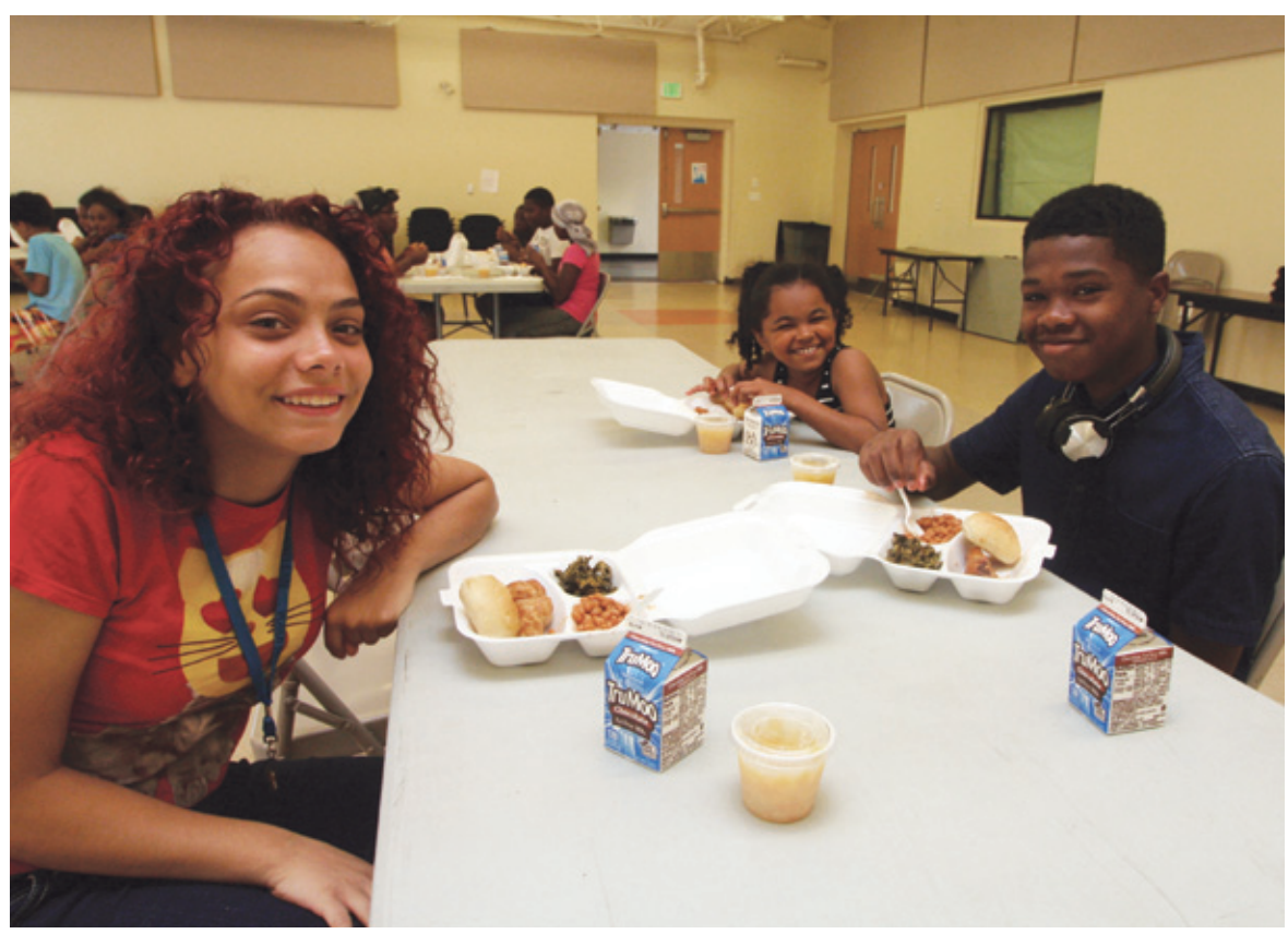
PHA is one of several large sponsors in the city that provides breakfast and lunch to youth via the Summer Food program.

The new policy applies to all PHA units and calls for a written notice of lease termination after the fourth violation. The notice encourages a resident to meet with their Property Manager to receive cessation support and information. The notice will also explain that a fourth violation may lead to eviction if a Philadelphia court of appropriate jurisdiction so orders. Residents are responsible for their guests and a violation of the policy by guests shall be considered as a violation by tenant.