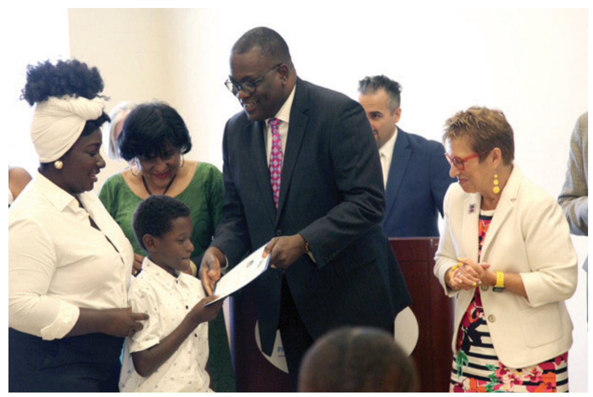
PhillySEEDS, Inc., a PHA charitable subsidiary, honored 71 PHA residents seeking higher education with $270,000 in scholarships during the July Board of Commissioners meerting. That's a record for both the number of recipients and the dollar amount. A total of almost $1.3 million has now been awarded to 343 residents since this award-winning program began in 2013.

composed of PHA employees, student residents, and a resident leader reviewed the applications. The applicants' essays, community service, extracurricular activities, internships, recommendation letters, and academic transcripts were considered by the committee.