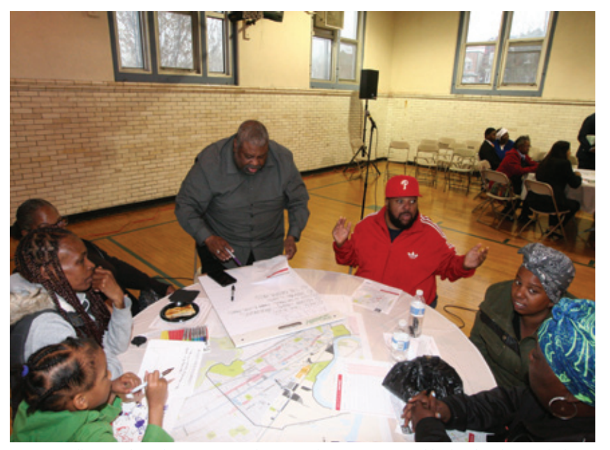
Bartram Village residents discuss assets and issues in the Kingsessing neighborhood at the initial Choice Neighborhoods planning session for the community.