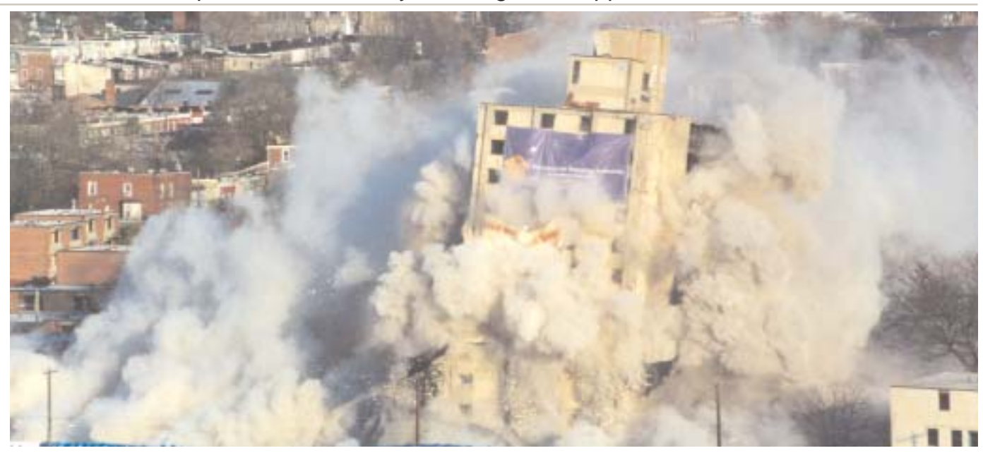
Mill Creek Implosion

PHA communities have suffered from decades of neglect and under-funding. Therefore, over the past five years, one of PHA's primary areas of focus has been to obtain the resources needed to fully revitalize existing public housing communities and to move construction activities forward at a fast pace. In addition, new development activities are also a priority for PHA as they can offset the loss of units resulting from density reduction at HOPE VI sites and contribute greatly to the City's neighborhood revitalization efforts.