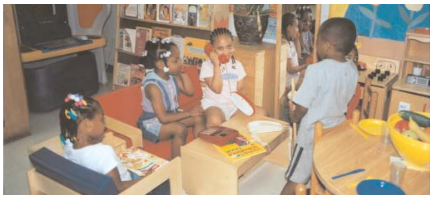
Day Care Center

PHA continued and expanded its efforts to enhance resident economic self-sufficiency during the past year. Through a wide range of creative partnerships, PHA sponsors and/or directly operates numerous economic self-sufficiency and social service programs. The goals of these programs focuses on assisting residents to maximize their individual potential, build self-sufficiency skills and become involved in positive, uplifting activities. Residents of all groups are serviced through these initiatives including early childhood development, youth after school, adult employment and training, and senior service programs. Supporting residents to become homeowners through programs such as 5-H, Section 8 Homeownership, III and HOPE Homeownership is also a primary focus of PHA activities under this broad goal