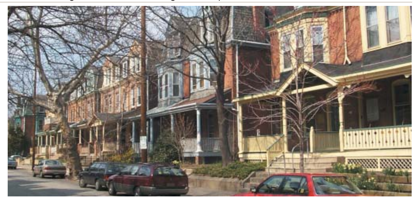
Housing Choice Neighborhood

PHA's Housing Choice Voucher Program (formerly known as Section 8) provides rent subsidies to approximately 15,691 low-income households living throughout the City of Philadelphia. In the past year alone, PHA assisted 1,747 new households through the HCV program.