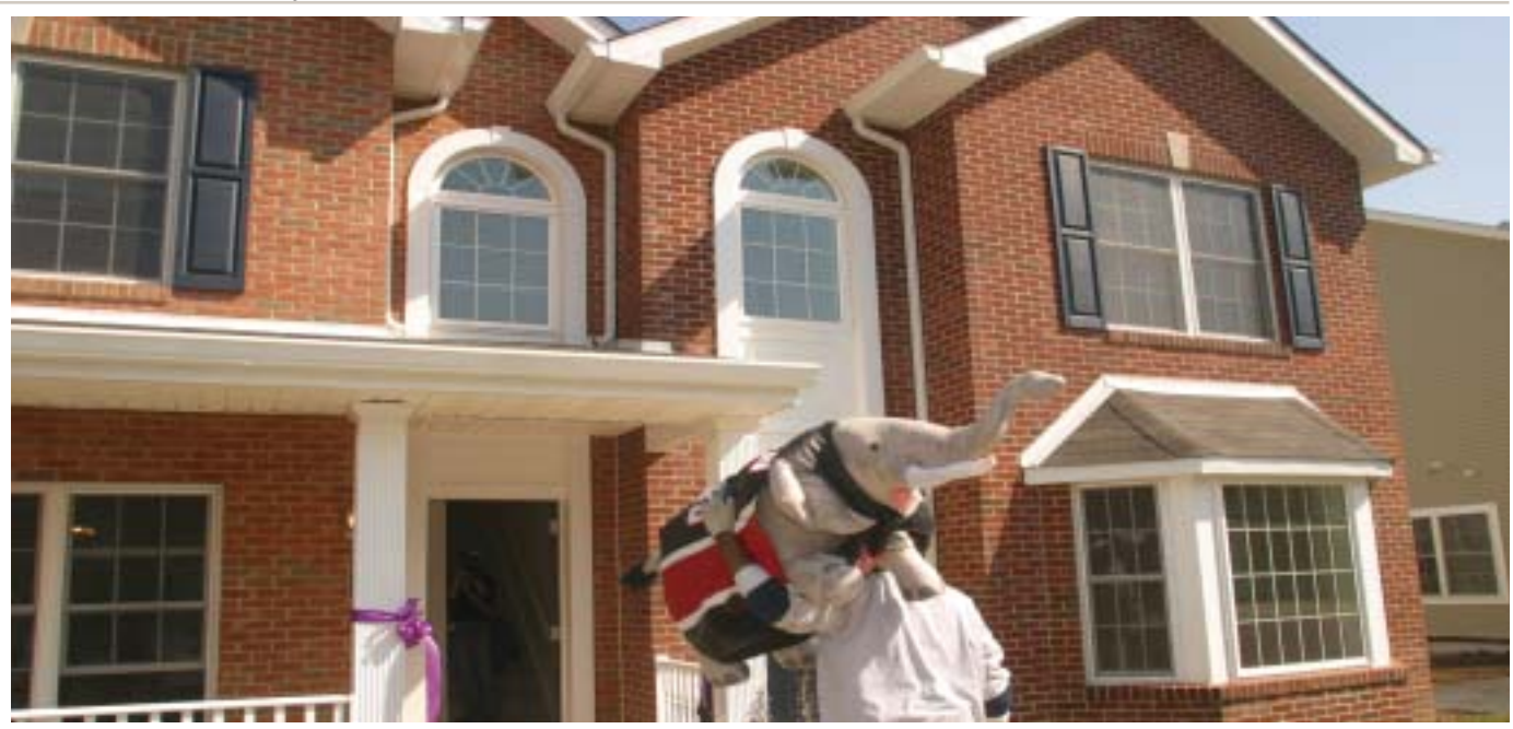
Richard Allen Phase III Grand Opening

Over the past year, the Philadelphia Housing Authority (PHA) continued to make dramatic strides in accomplishing its core mission and meeting its Strategic Operating Plan objectives. This report provides a summary of major agency accomplishments for the fiscal year period from April 1, 2002 through March 31, 2003. The accomplishments described in this report underscore the dramatic progress made over the past five years in revitalizing PHA communities, expanding the provision of employment, training and other services to PHA residents, upgrading the Housing Choice Voucher Program, building partnerships with local organizations, and implementing improvements throughout all levels of PHA's management operations.