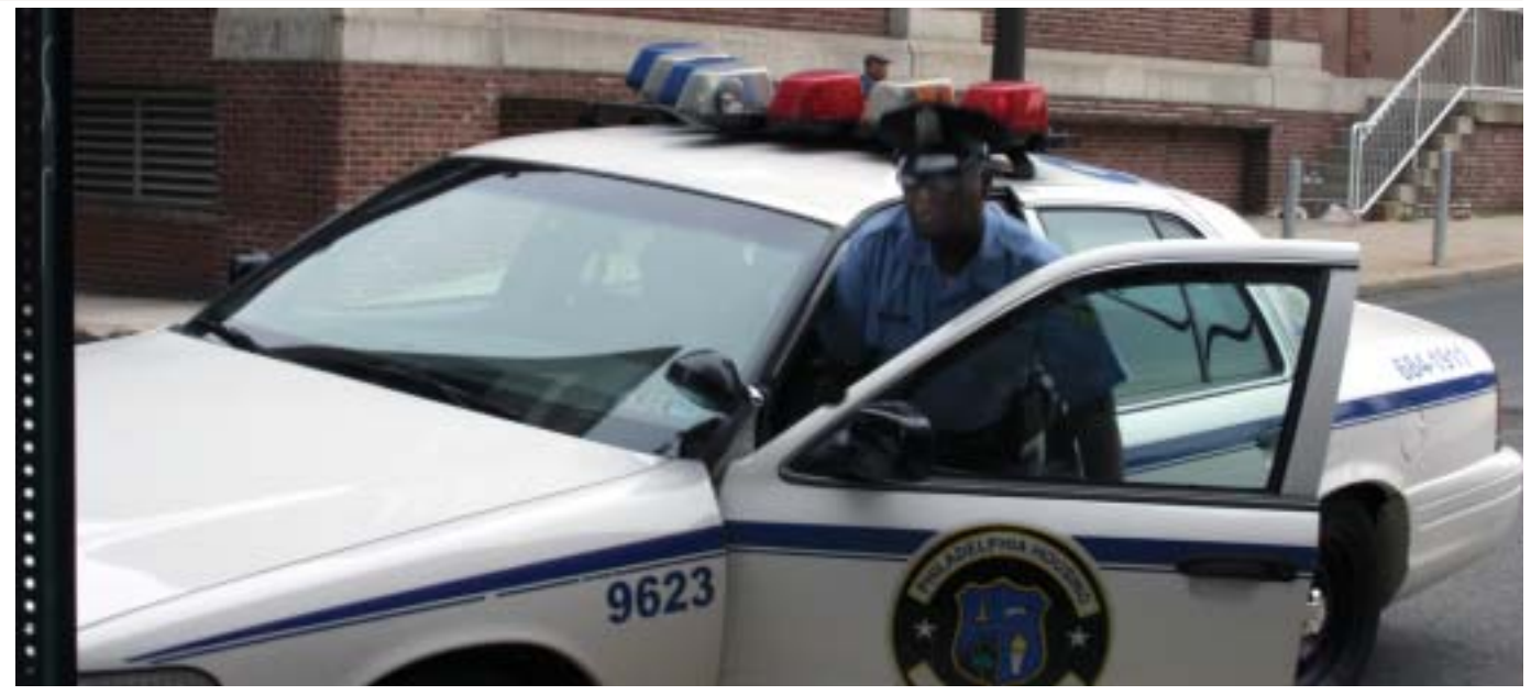
PHA Police on Patrol

PHA continued and expanded its comprehensive approach to improving community security at PHA developments over the past year. PHA developments have become safer communities as a result of an extensive site-based, community policing program undertaken by the PHA Police Department. PHAPD utilizes a comprehensive approach to crime reduction that emphasizes crime prevention, conflict resolution, resident involvement and community partnerships. The results are encouraging: over the past two years, Part I crimes have decreased 28% at PHA conventional sites and 47% at scattered sites. The overall reduction at PHA properties from calendar year 2001 to 2002 was 24% for Part I crimes and 29% for Part II crimes.