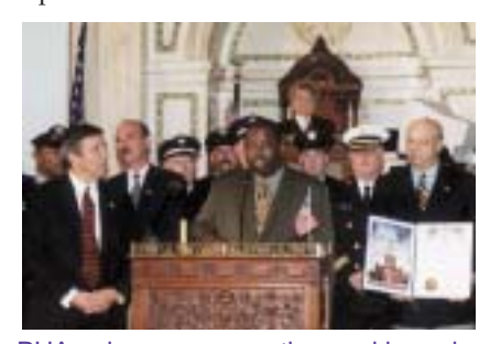
PHA enjoys a cooperative working relationship with Philadelphia City Council.

PHA established interagency agreements with City of Philadelphia agencies to allow: 1) the PHA Police Department to purchase and connect with the City Police Department's 800 mhz radio system; 2) the PHA to procure the same trash removal vehicles as those used by the City; and, 3) City departments to access PHA services including code related repairs, lead based paint repairs and emergency repairs.