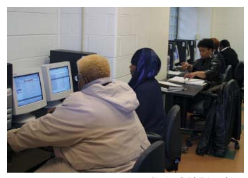
Blumberg Self Sufficiency Center