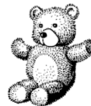
Special Care Items: Diapers, Formula, Toys for Kids, Baby Wipes