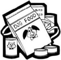
Pet Food and Bowls

Yes, please bring your pet with you if you are going to the comfort center. A separate area at the comfort center will be available for pets. You should bring: