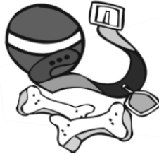
Pet Identification and Toys