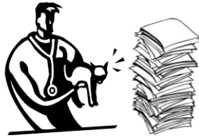
Pet Medication and Veterinary Information