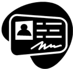
Copies of Identification