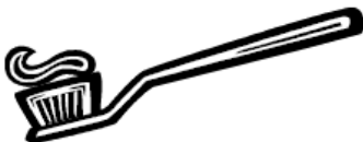
Personal Care Items: Toothbrush, Toothpaste, Feminine Products, Hand Sanitizer