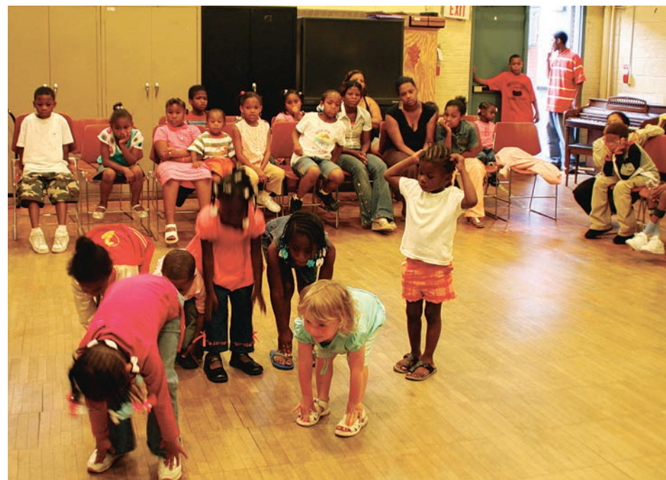
Children enjoy playing games like Simon Says and Musical Chairs during a rain delay at Liddonfield Homes' Safe Night event.

A sudden storm didn't dampen the spirits of Liddonfield Homes residents who turned out for Safe Night event on June 9th.