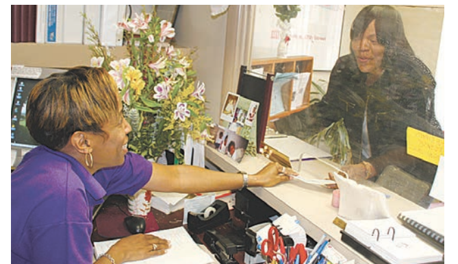
When PHA residents pay their rent, it is important that they report their income fully. PHA is planning a crackdown on unreported income that will be costly for violators.

If you don't report all of your income to PHA during your recertification appointment, does it really hurt anyone?