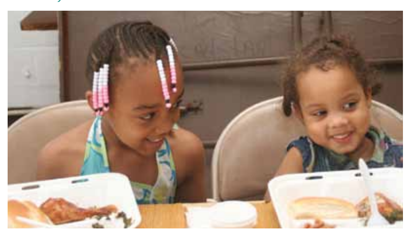
PHA's Summer Food Program ensures that kids have a healthy, nutritious lunch. All eligible children ages 18 and under are able to receive free breakfast or a snack and lunch.

PHA's Summer Food Program is underway at 21 sites across the city offering children nourishment for their bodies and minds. Young PHA residents and children from surrounding neighborhoods receive a good breakfast and lunch and lessons on good nutrition.