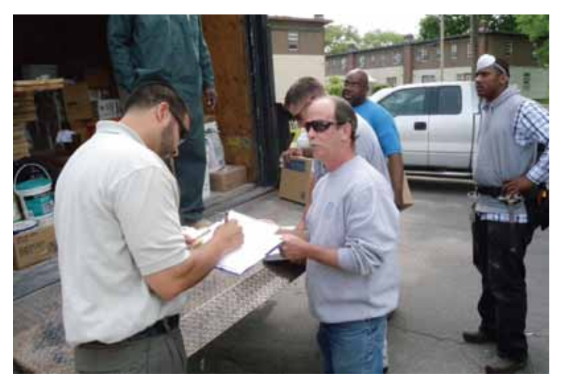
Crew members receive their work orders and materials at the truck shown in this photo at Oxford Village.

Hampson said once the site visit is complete, materials are ordered and the WAVE crew swarms the site. No time is lost because everything is in place, including a computerized mobile unit at the site where crews get their work orders.