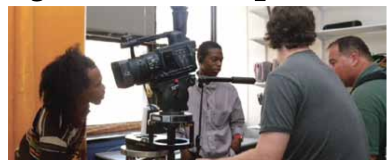
YES students work with a film crew in the program's digital media studio. YES's new alternative school will feature a number of media labs.

"We discovered that media is an effective way to get students who dropped out excited about learning.