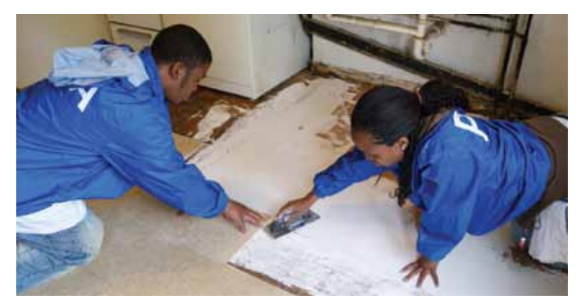
Graduates of PHA's Pre-Apprenticeship Program are included on the WAVE teams, providing employment and experience for PHA residents. These two graduates are shown repairing a floor in a home at Oxford Village.

"We visit a site before WAVE crews ever arrive to do their work. We go into every unit and common areas, and inspect for anything that's broken or in need of maintenance. Then, we generate the work orders for the site," he said.