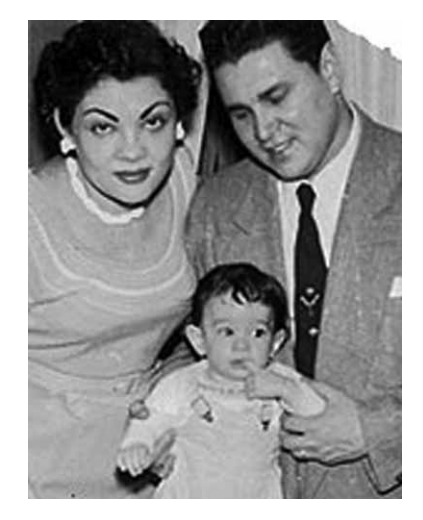
Sonia Sotomayor with her parents in NY public housing project.

If Sotomayor's appointment is confirmed by the Senate, she will be the first Hispanic justice on the Supreme Court.