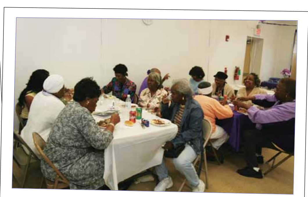
The luncheon in June was organized by Champlost's Senior Committee and sponsored by the Tenant Council as a belated Mother's Pay celebration.