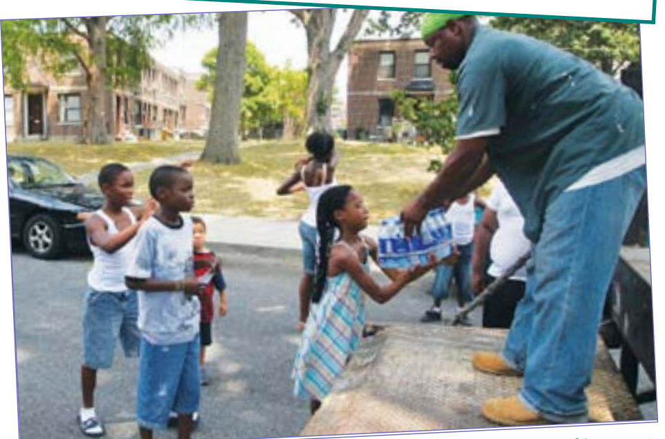
PHA staff distributed bottled water to Hill Creek residents to help them beat the heat this summ The initiative was made possible by a generous donation from Walmart.