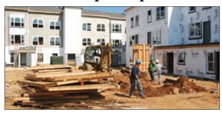
The first phase of Mantua Square will be completed by the end of this year.

"We're still doing physical needs assessments of our existing conventional