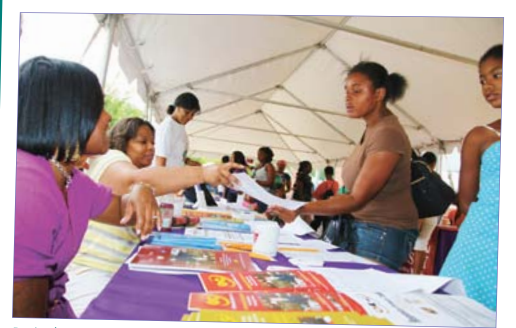
PHA's 2<sup>nd</sup> annual Family Affair Event was held at Wilson Park on July 29. Hundreds of residents came out to learn about a variety of programs PHA and its partners have for job training and