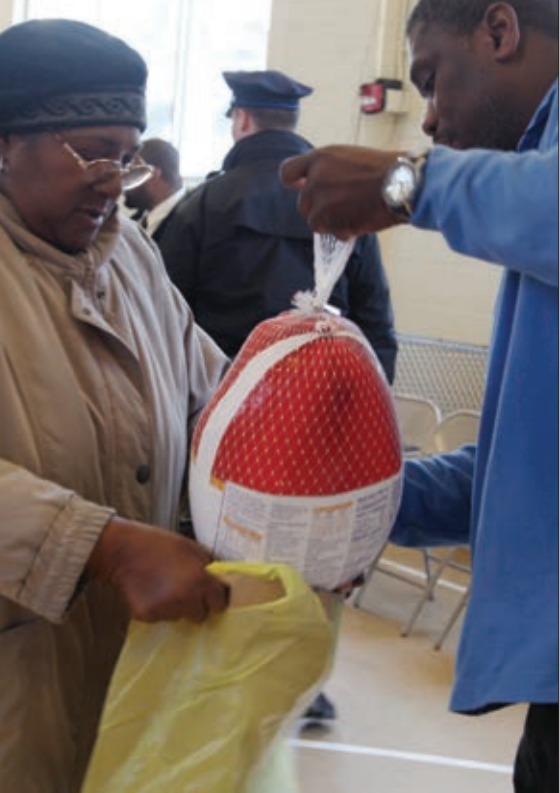
PHA gave away 2,000 turkeys to residents at multiple developments for Thanksgiving.