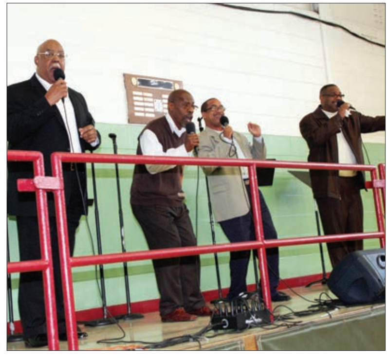
Hundreds of PHA seniors ring in the holidays at the annual senior luncheon.