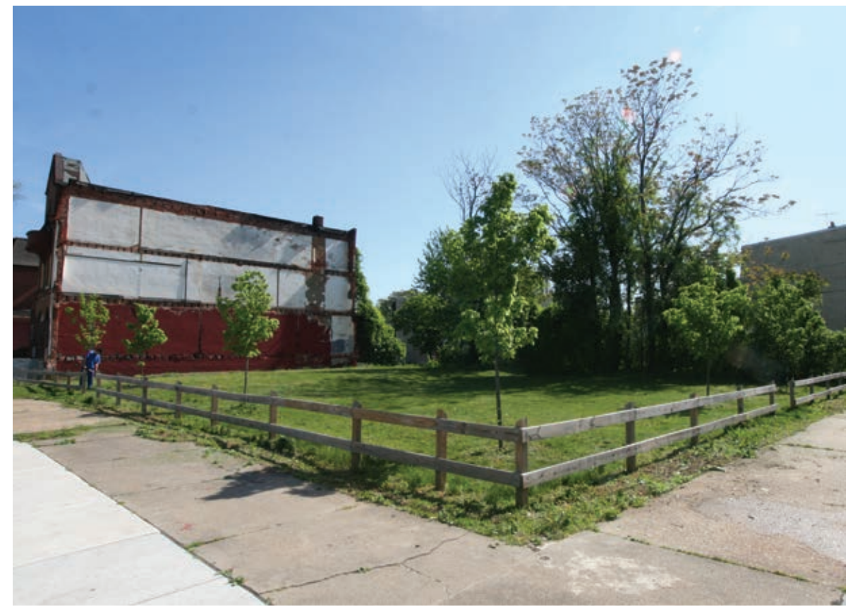
PHA expects to begin construction of the Strawberry Mansion/Oakdale development next spring. Most of the new units will be located north and east of 33rd and Berks Streets, next to Fairmount Park.