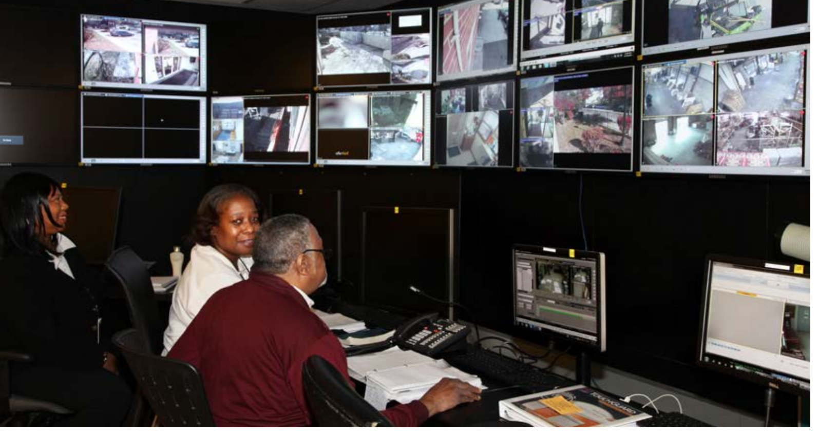
The new Command Center monitors hundreds of cameras that are operating on site at PHA developments.