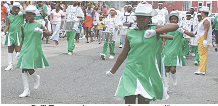
Drill Team on the move wearing new uniforms.

Teenagers in the Southwark neighborhood of South Philadelphia proved that if you have good ideas and good people to get projects accomplished you can achieve almost anything. These teenagers live at PHA's Courtyard at Riverview development at 4th Street and Washington Avenue and work with Southwark's Youth Committee. The committee works to change the quality of life for