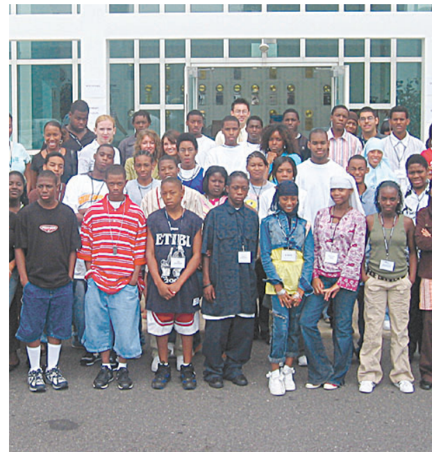
2005 Business Boot Camp Attendees

The 2006 Business Boot Camp will be held from August 1st to August 5th. Admission to the Business Boot camp is always very competitive. If you are inter-