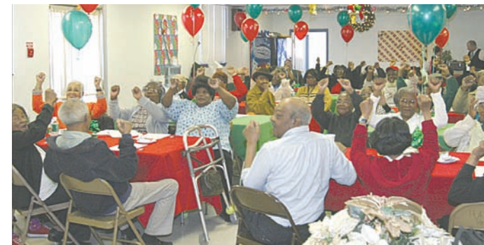
Seniors enjoying a wonderful Christmas party as the Tree Lighting caravan came to Katie B. Jackson.