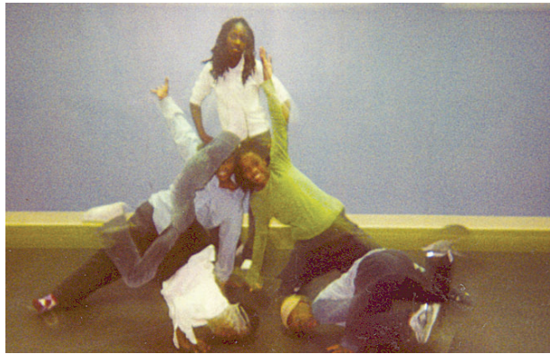
Kids enjoying dance class at the John F. Street Community Center after school program.

Philly Moves is a collaboration of the City of Philadelphia, Philadelphia Housing Authority, Tenant Support Services Inc., Resident Tenant Councils, School District of Philadelphia and the Point Breeze Performing Arts Center. These agencies have come together to provide families with a full menu of services.