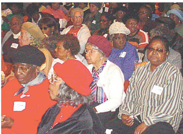
Over 500 people took part in the 13th Annual Philadelphia "Be Utility Wise" Fair and Workshops.

Sixty PHA residents were among 500 people who came looking for ways to save money on their winter heating bills at the 13th Annual Philadelphia "Be Utility Wise" Fair. The fair was conducted by the Pennsylvania Public Utility Commission at Community College of Philadelphia just as a cold snap hit the region.