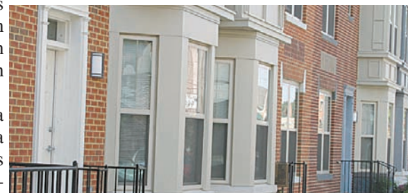
New townhouses in South Phila. for sale at PHA's Martin Luther King Development

higher because the homes are located so close to the Avenue of the Arts and South Street. But the homes are still affordable for moderate-income families.