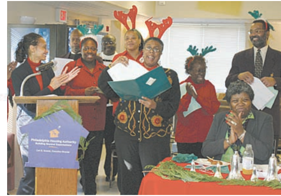
Musicians and singers made up of Residents and PHA staff having fun at Gladys B. Jacobs.