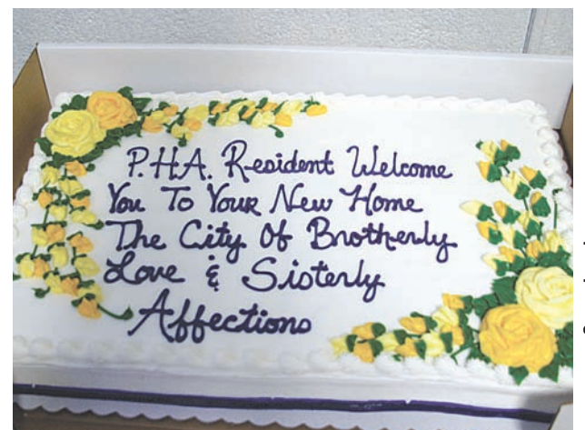
Cake served at the lunch welcoming new residents.