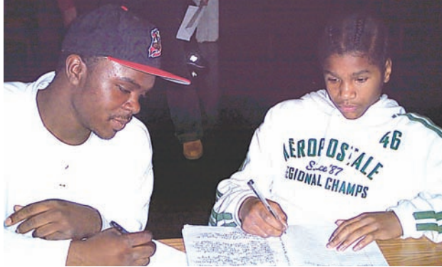
Skills for Life volunteer mentoring young student.