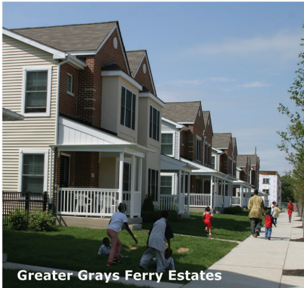
Greater Grays Ferry Estates