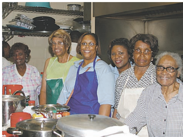
PHA residents and employees prepare lunch for Katrina evacuees.

Pictures on TV of citizens who had lost everything compelled Mayor John Street to call Washington, and offer to house evacuees. The city first set up Katrina headquarters at the Wanamaker school building in North Philadelphia. PHA employees joined workers from the school district in volunteering many hours around the clock to get the school ready for evacuees. Then PHA took the new arrivals on tours of available housing, with