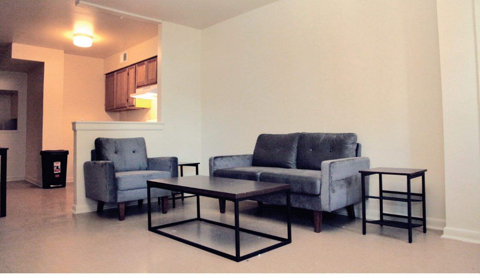
The PHA-CCP Shared Partnership provides subsidized housing and hands-on services for community college students.