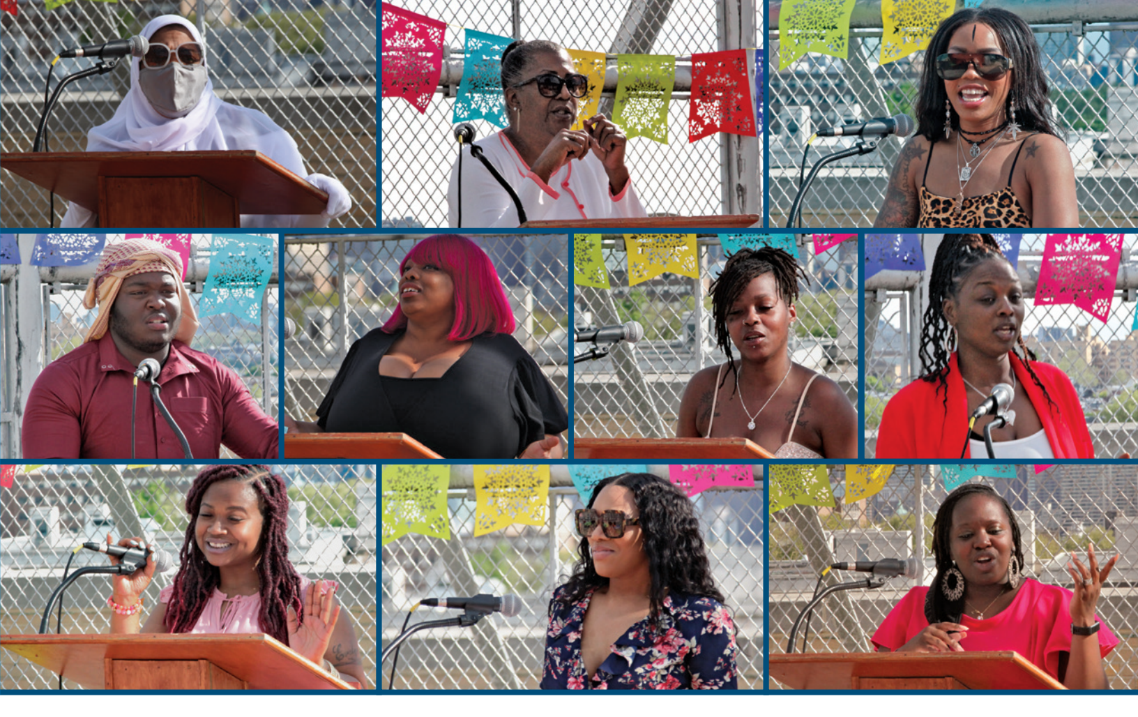
The PHA Workforce Center partnered with CVS Pharmacy on a new learning hub where residents can train to be pharmacy technicians.