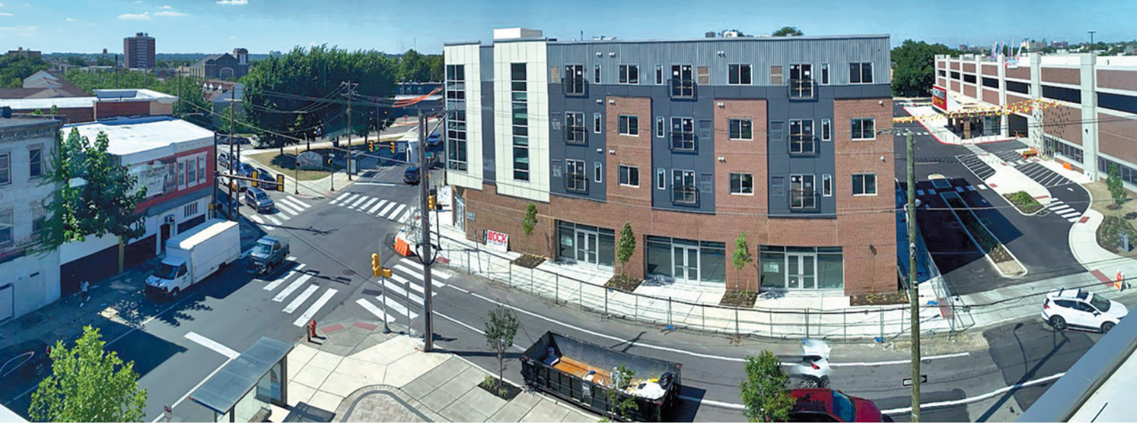
Sharswood Ridge neared completion with rental units and a neighborhood commercial center including a grocery store, a bank and an urgent care cente.