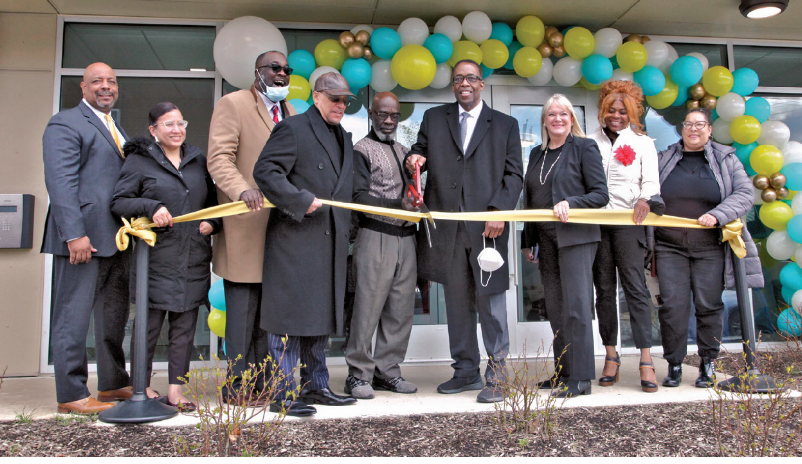
The Susquehanna Residences celebrated their grand opening in Strawberry Mansion.