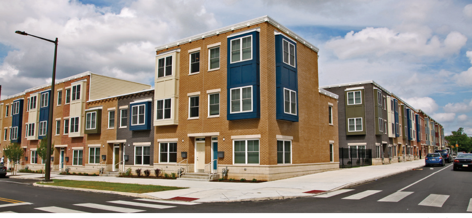
Hunt-Pennrose Ground Breaking