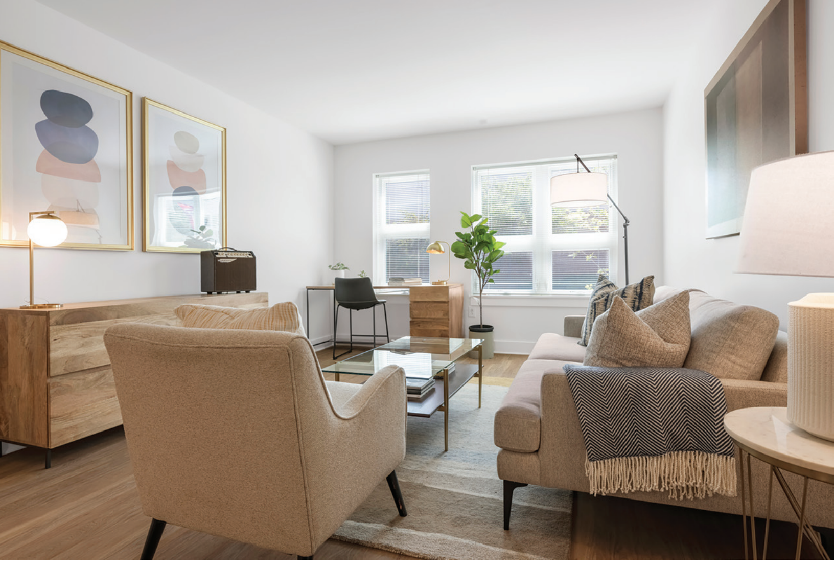
Each home at North Central Five features a spacious, open-concept layout filled with natural light and cost-saving amenities and appliances.