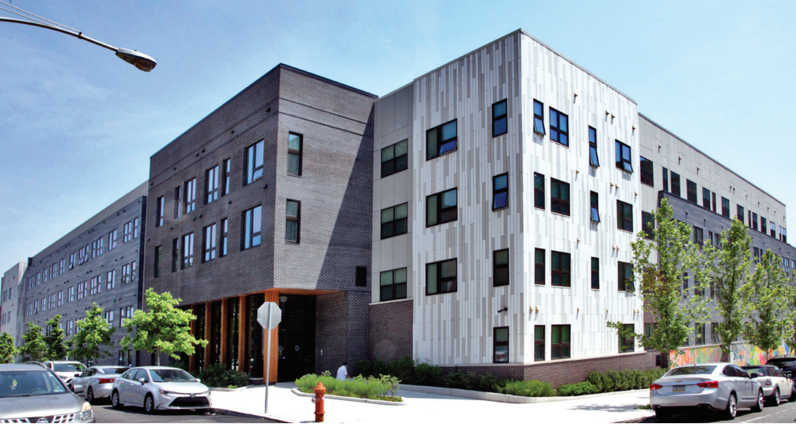
North Central Five was honored for project design by NAHRO, a national housing group.

PHA is revitalizing old, run down neighborhoods with newly designed, high-quality housing. We're doing it with the help of private investors. And best of all, PHA is influencing private developers who want to come back into Philadelphia and renew the City.