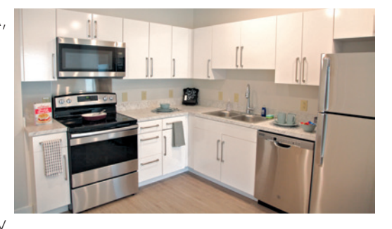
Affordable housing developments include modern kitchens with energy-efficient appliances.

Additionally, construction was substantially completed on a 78-unit