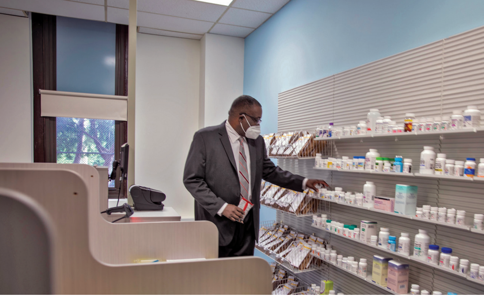
The PHA Workforce Center partnered with CVS Pharmacy on a new learning hub where residents can train to be pharmacy technicians.