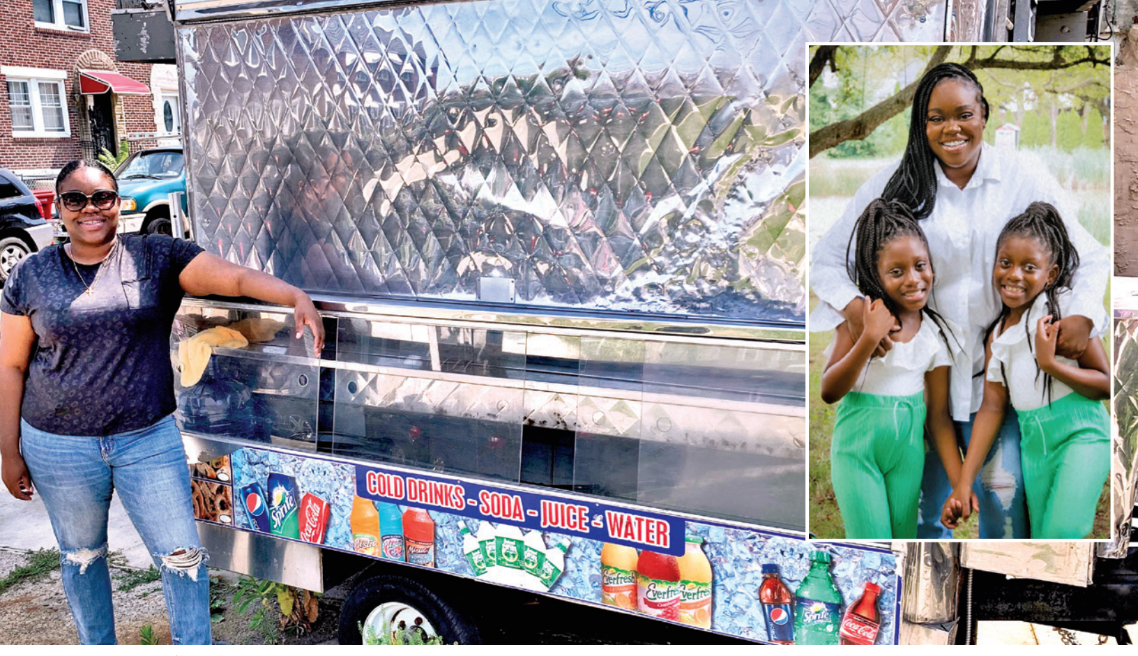
The PHA Workforce Center partnered with CVS Pharmacy on a new learning hub where residents can train to be pharmacy technicians.