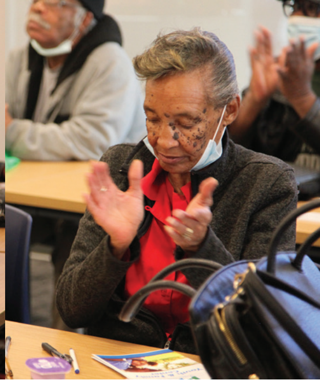
Resident leaders gathered at the Youth and Family Center.