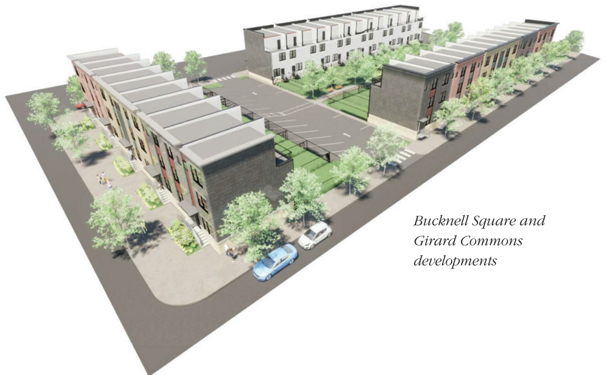
Bucknell Square and Girard Commons developments

old public-housing complex demolished in 2016 that for years were the epicenter of crime and poverty in the area. The new workforce housing developments will help revitalize the neighborhood and represent part of a $30 million Sharswood Blumberg Choice Neighborhood Implementation Grant that was awarded to the City of Philadelphia and the PHA in 2020.